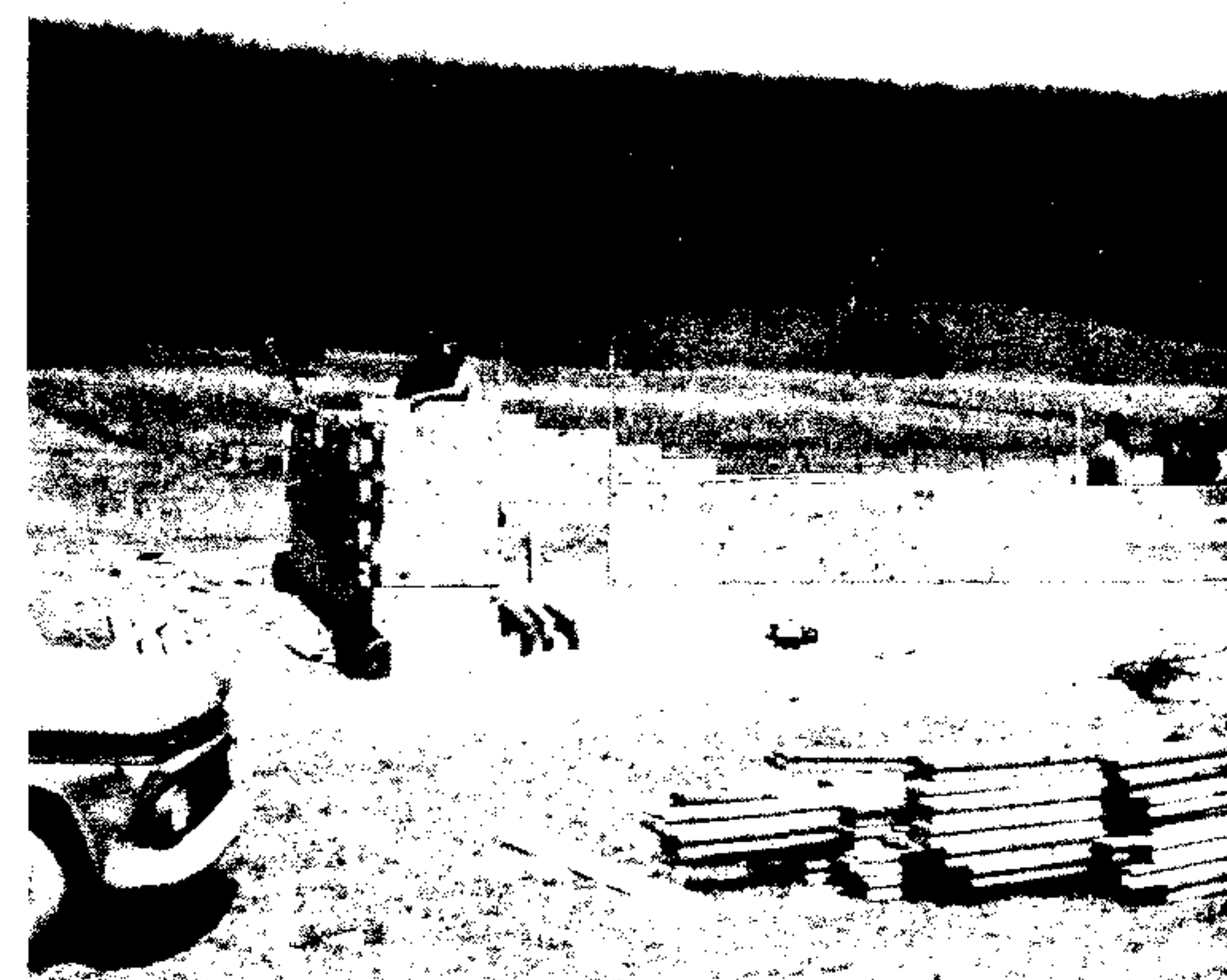
RMCB 12 trains

In January 1962, RMCB 12 joined MCB 6 at Davisville and at Camp Lejeune, N. C. for technical and military training. In 1963, elements