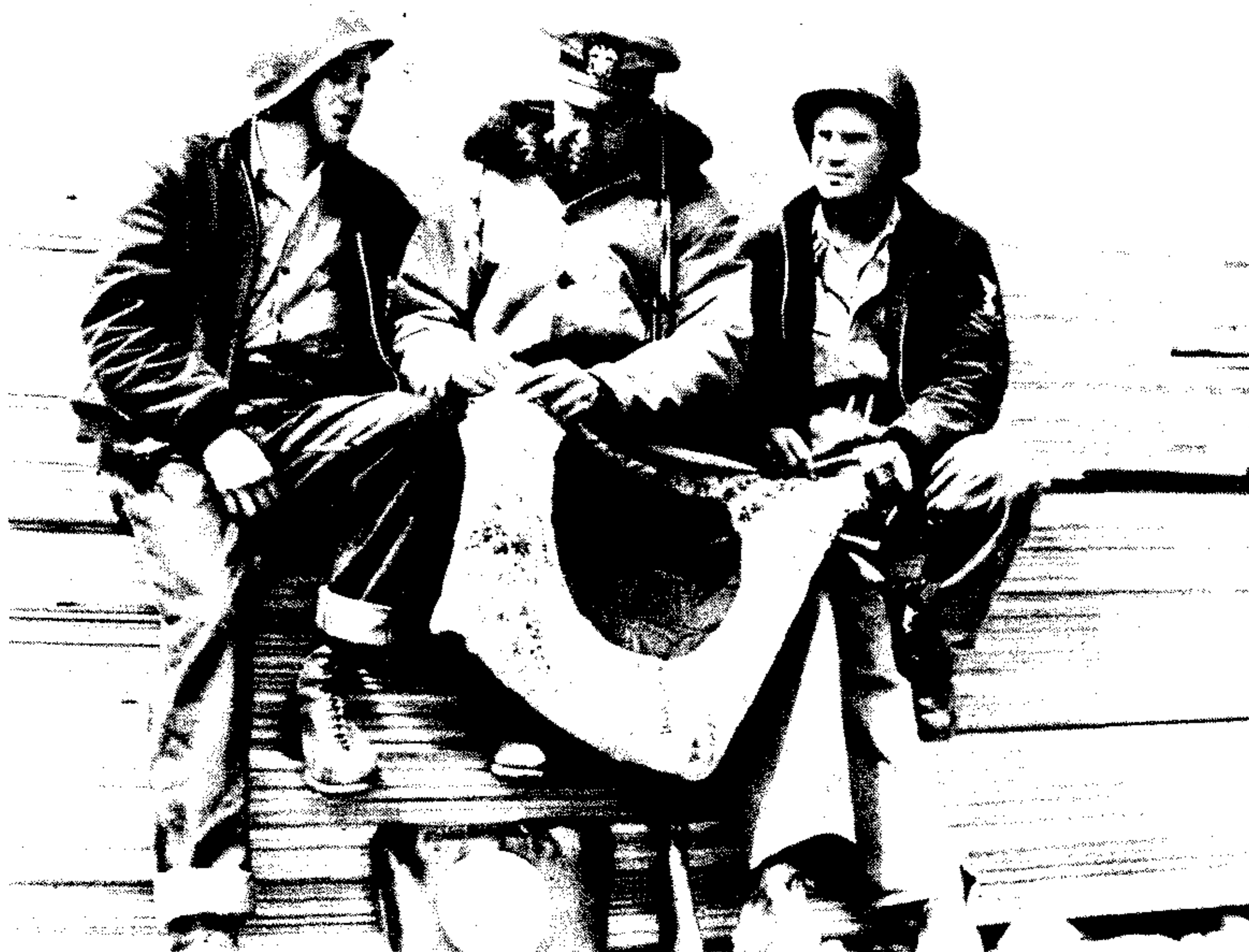
MCB 12's World War II Skipper autographs a Japanese flag

While at Kodiak the Battalion was split into a number of work details and completed several projects throughout the area. On April 10, 1943 the Battalion began moving to Dutch Harbor, Unalaska. Once again there were several detachments to projects in the area.